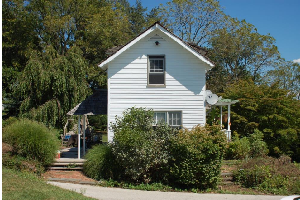
West Elevation, House