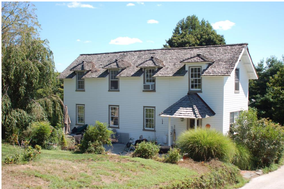
North (back) and West Elevations, House