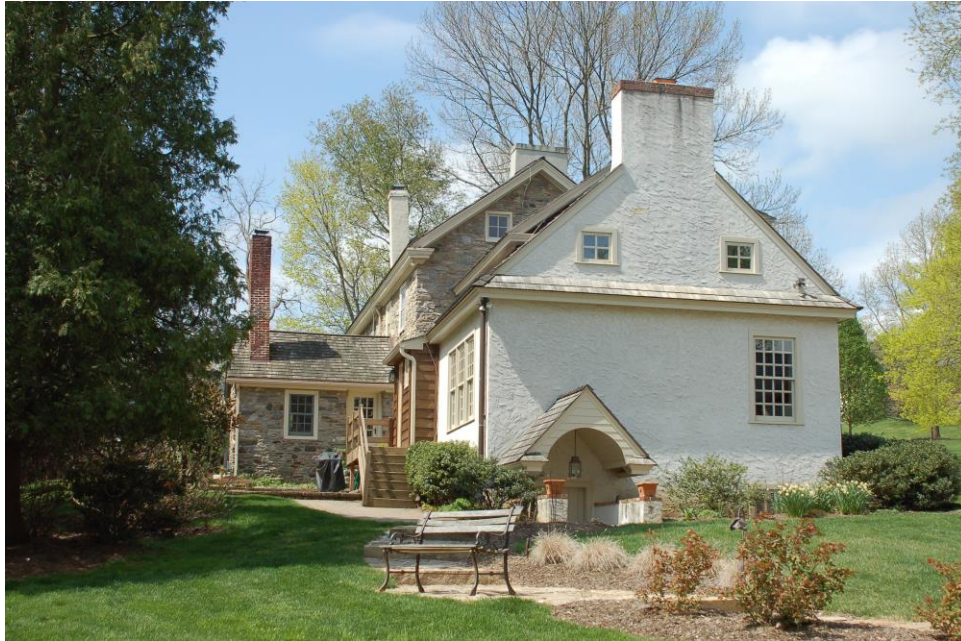
East Elevation, House