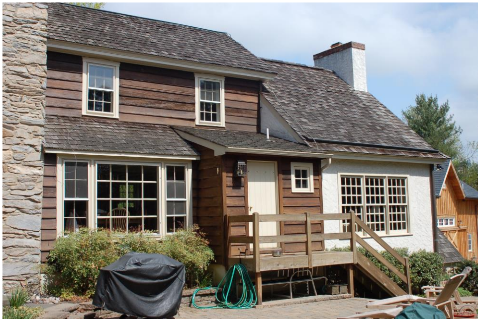
East End, South (front) Elevation, House