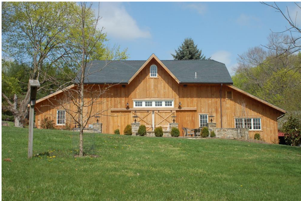
South (front) Elevation, Barn