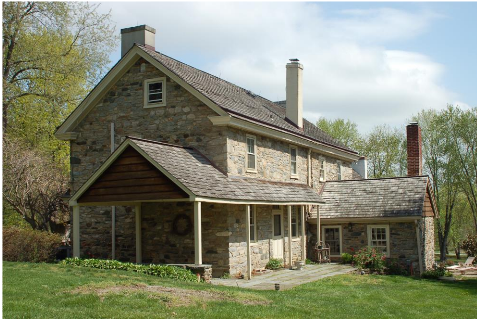
West Elevation and West End, South (front) Elevation, House