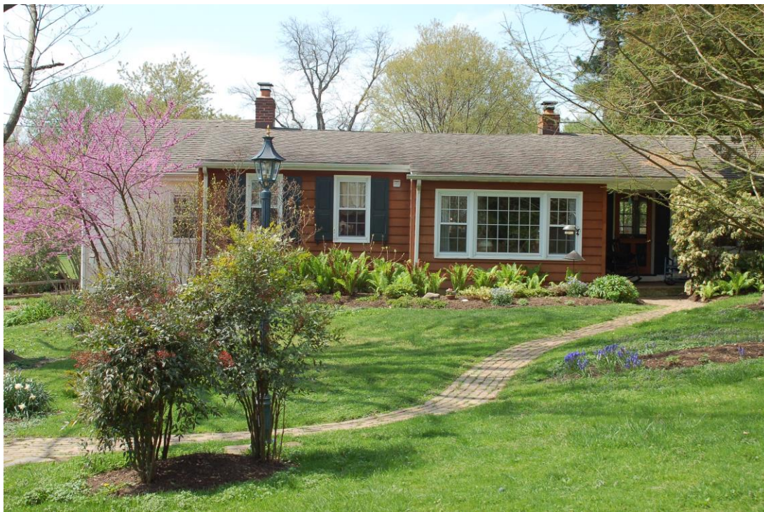
South (front) Elevation, House