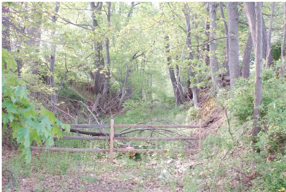
“The Tunnel”, Looking North towards Fair Acres (HR #005)