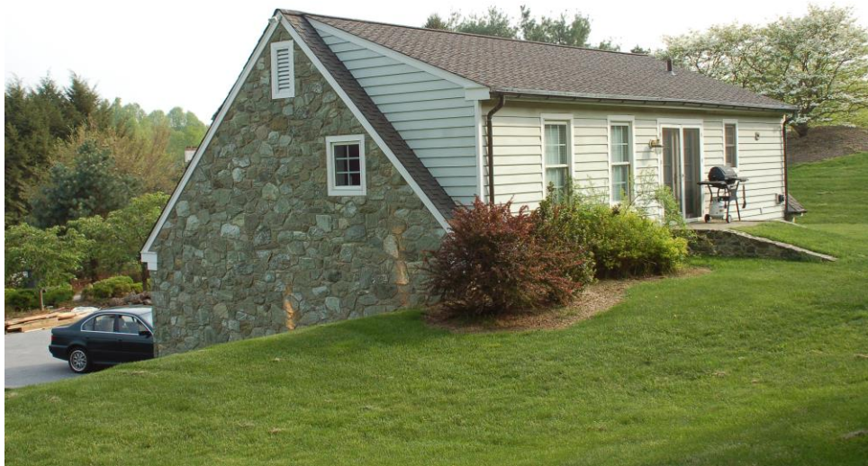
North (back) Elevation, Garage