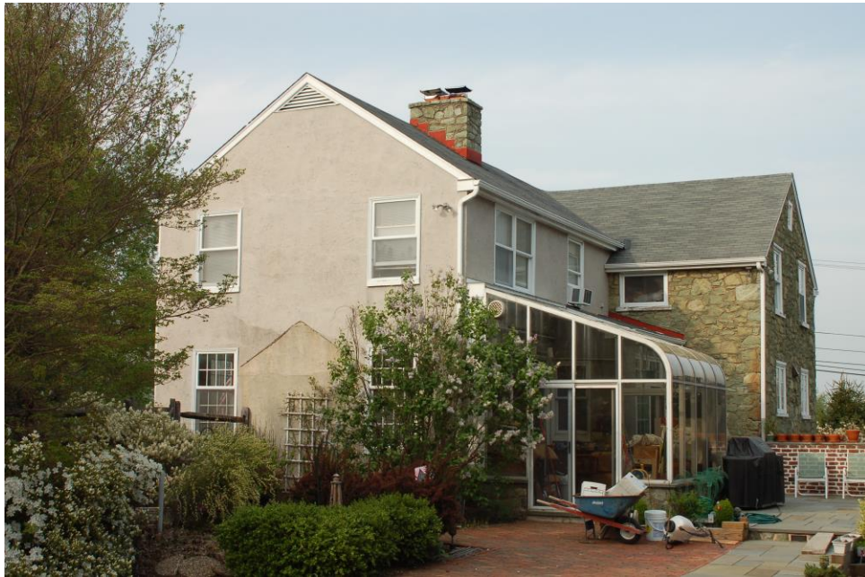
West and South (back) Elevations, House