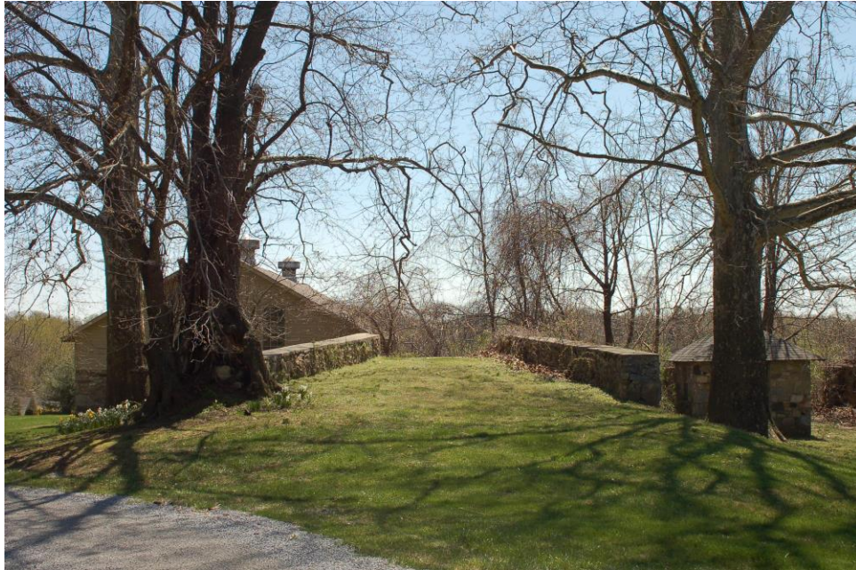
Barn Ramp, with Horse Barn on Left, and Small Outbuilding on Right, looking South