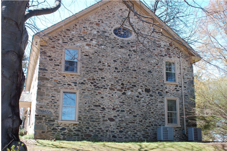
East Elevation, House