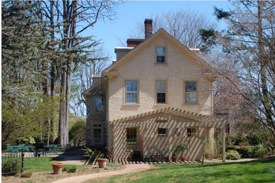
West Elevation, House