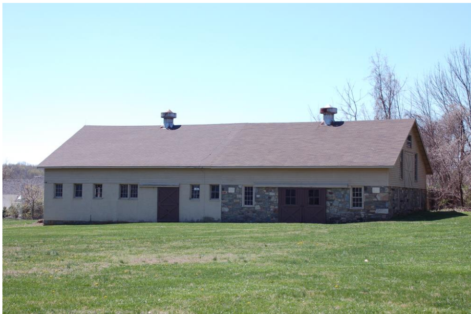
East and North Elevations, Horse Barn