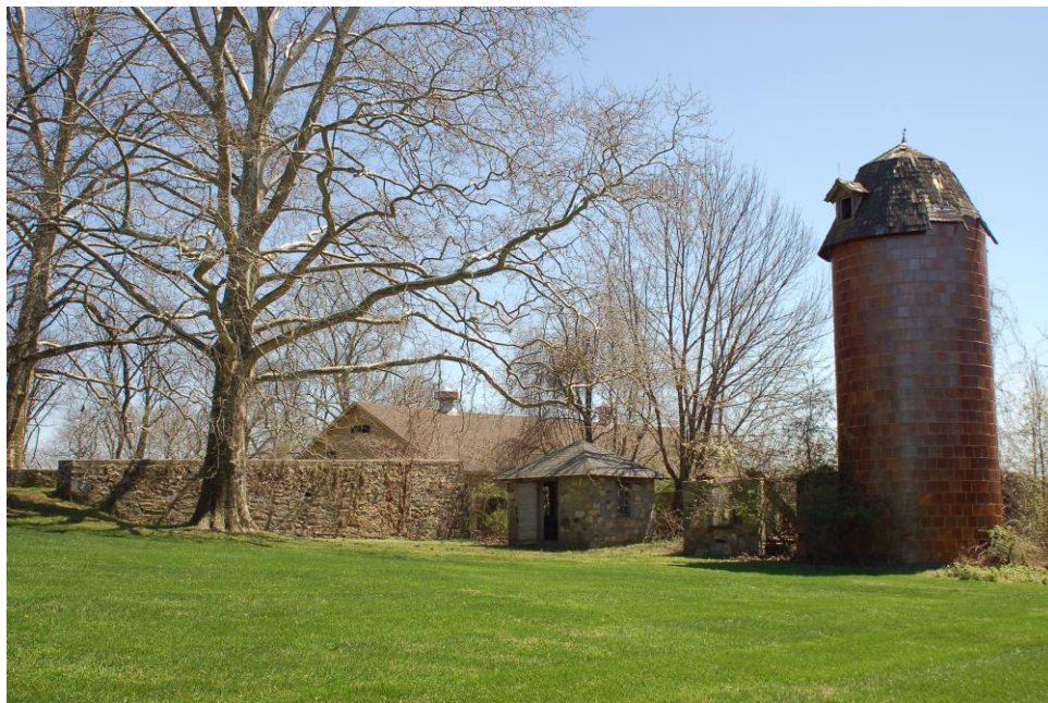
Silo, with (from right to left) Two Outbuildings, Horse Barn, and Barn Ramp, Looking Southeast