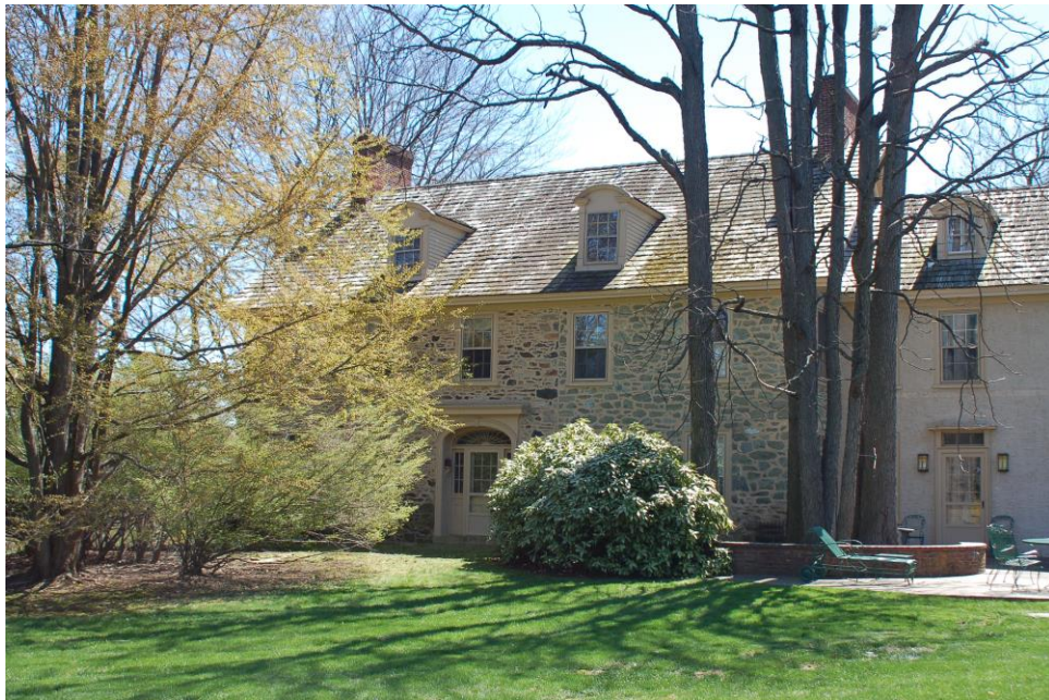
North (back) Elevation, House