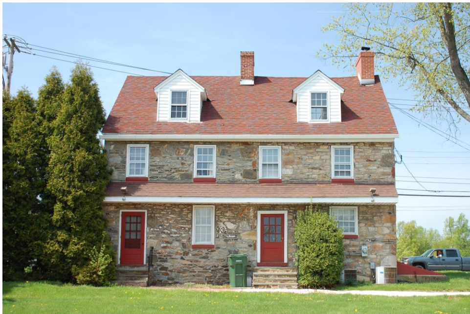
South (front) Elevation, House