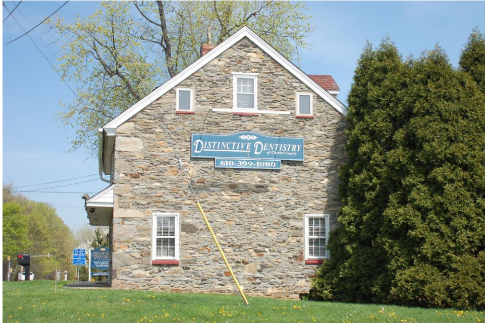
West Elevation, House