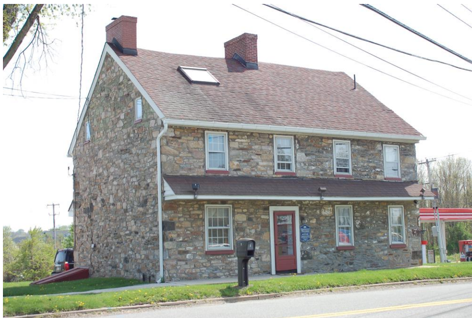
East and North (back) Elevations, House