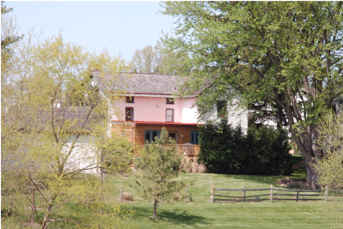
South (front) Elevation, House with South (back) Elevation, Garage