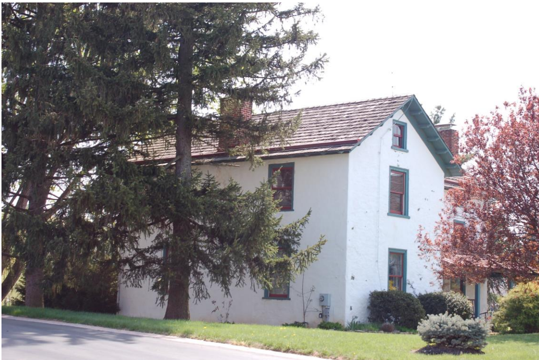
North (back) and East Elevations, House