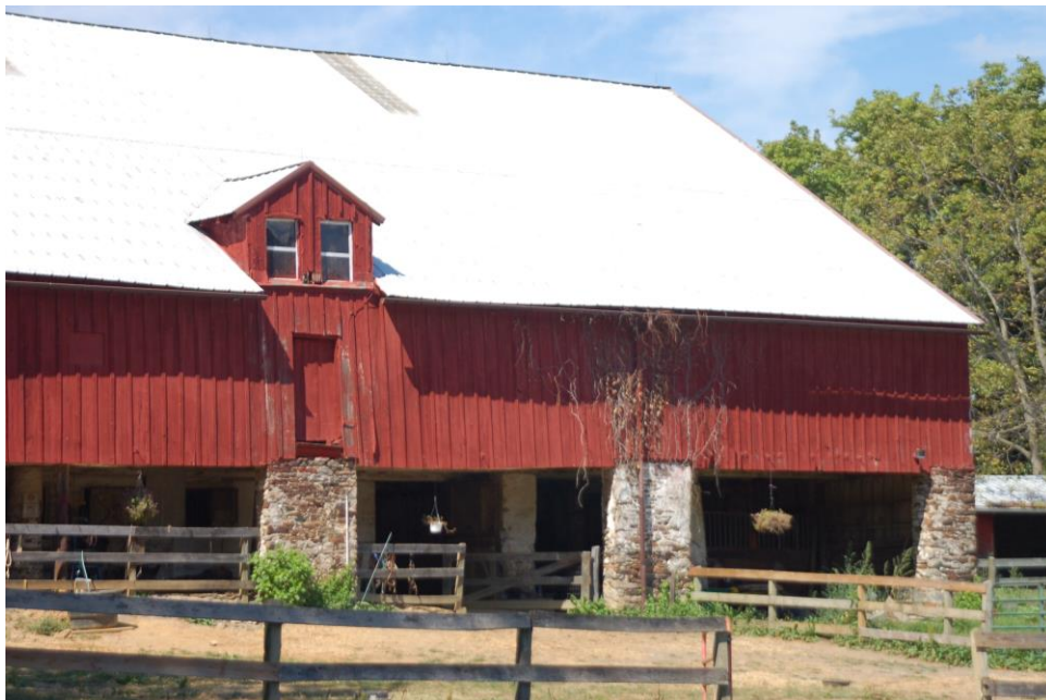
South (front) Elevation, Barn