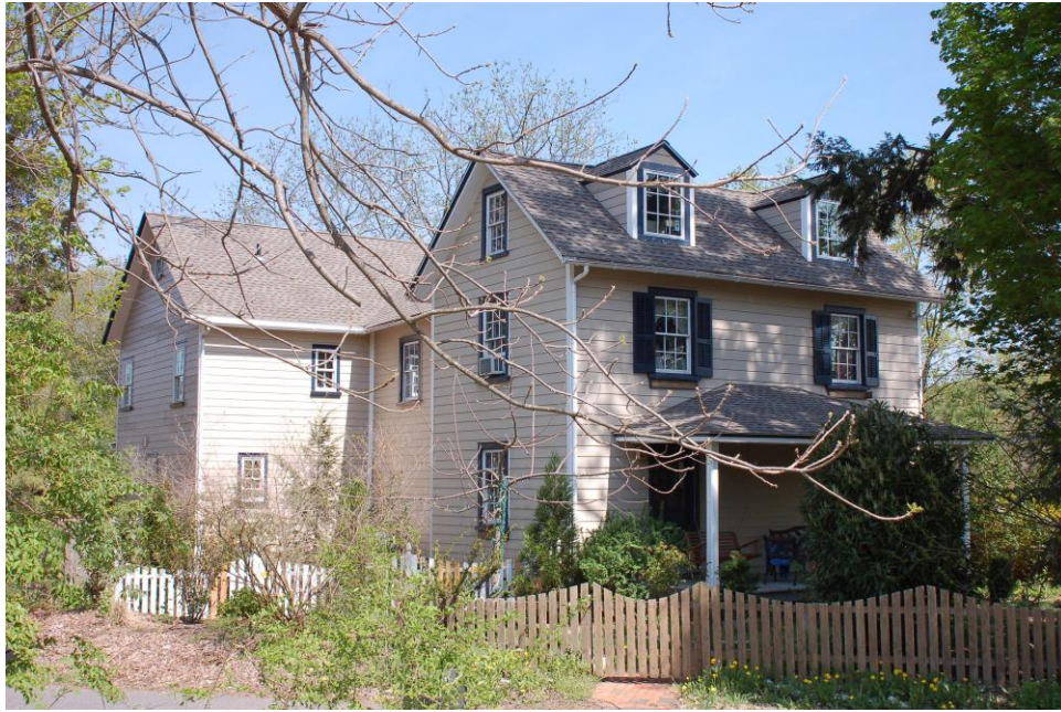
West and South (front) Elevations, Tenant House