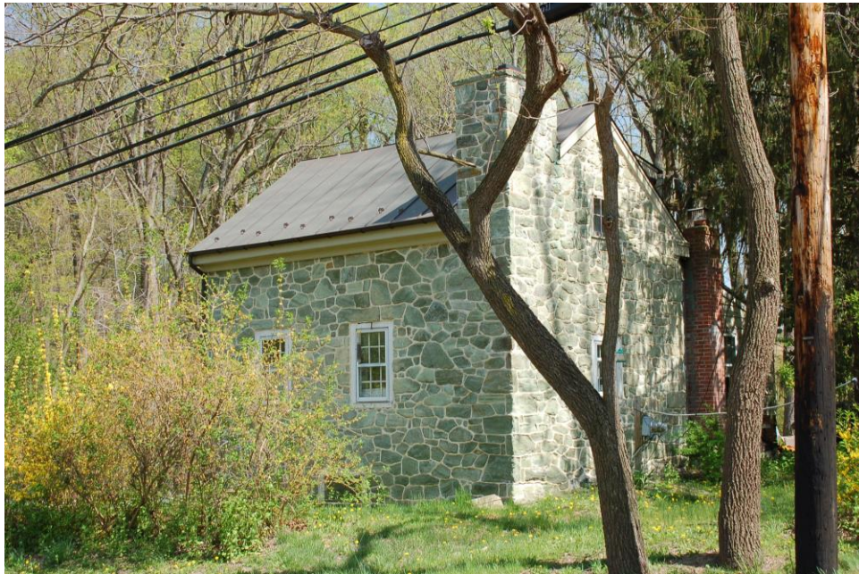
North (back) and West Elevations, Spackman Corner Chimney House