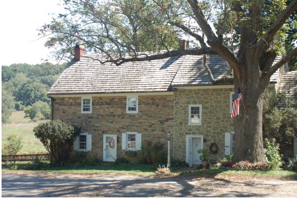
North (back) Elevation, House