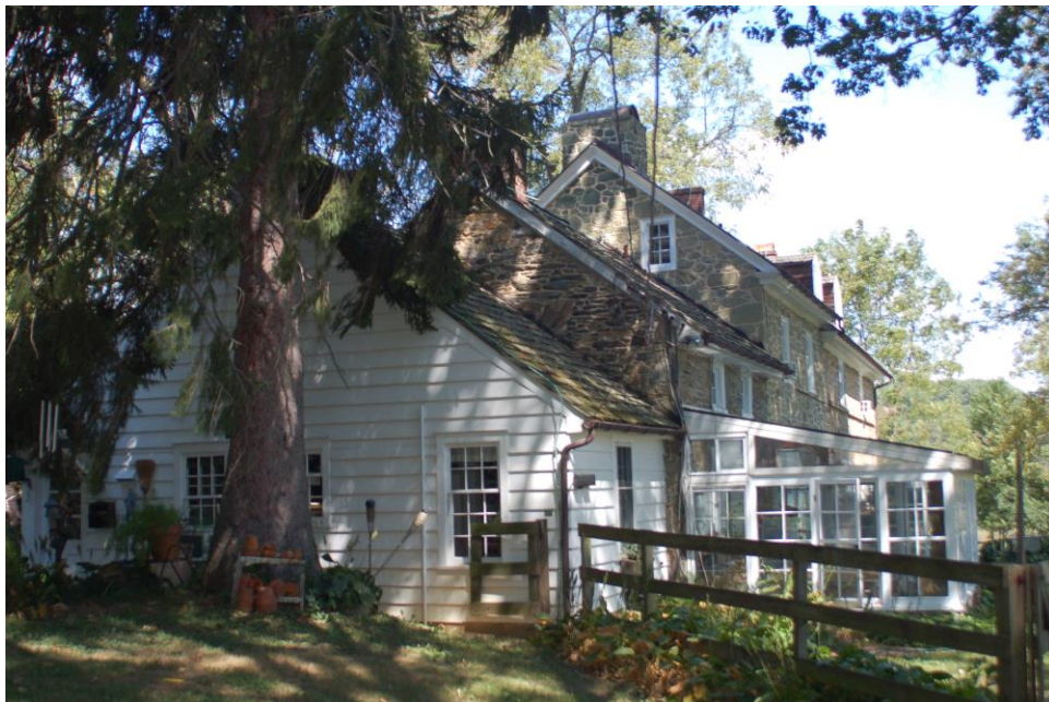
East and South (front) Elevations, House