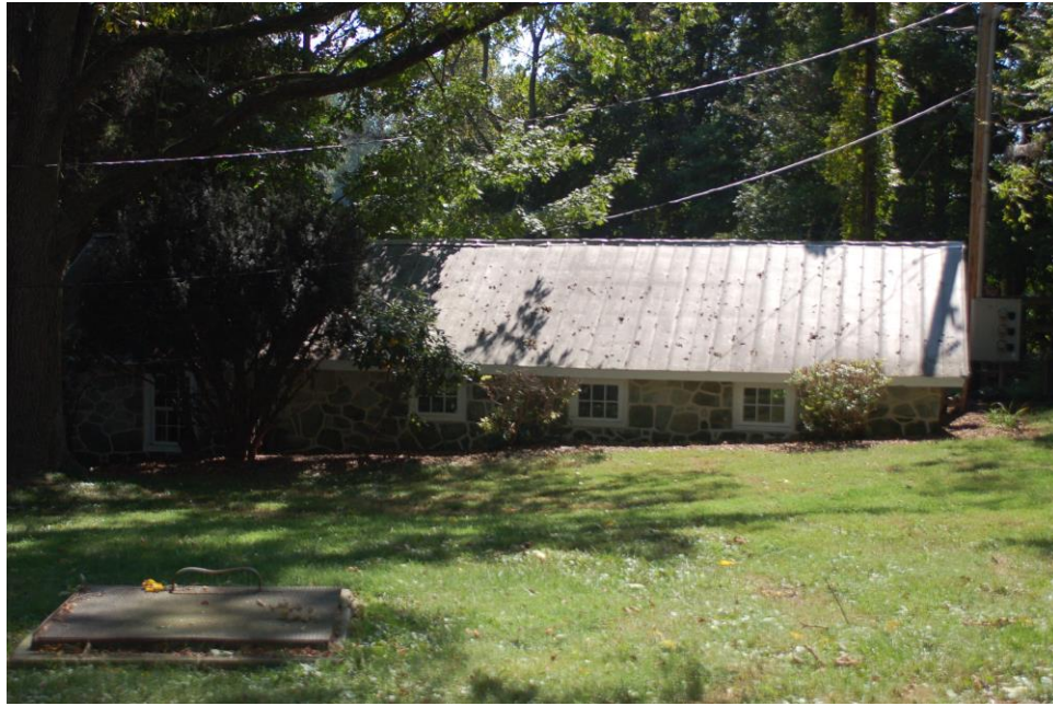
South Elevation, Spring House