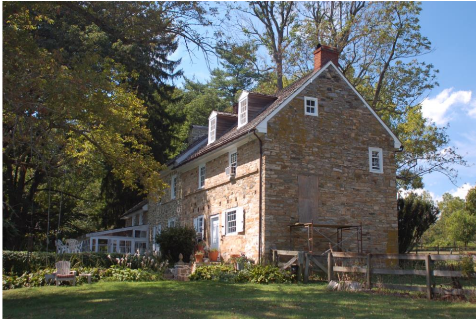
South (front) and West Elevations, House