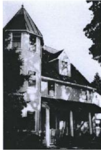
"The Buttonwood", Phoenixville.

Due to the small rooms of the house and relatively plain fit out, the house should lease for a fairly modest rent.