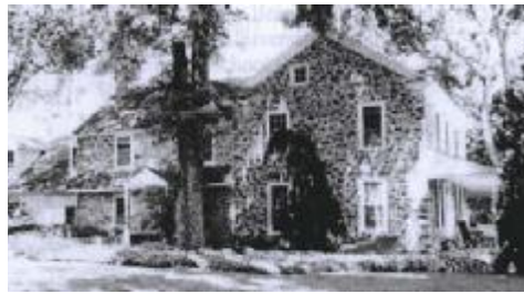
1732 Folke Stone