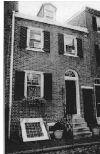
"Cypress" in Society Hill, Philadelphia.