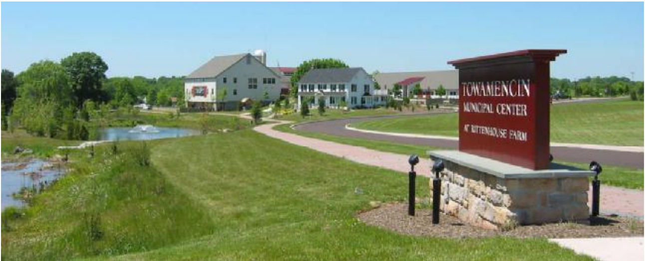
Towamencin Municipal Center. The building to the left is the barn, the farmhouse is on the right.

The Squire Cheyney barn would be an appropriate location for a Township building. The barn could be converted into a new municipal building similar to the new Towamencin Township facility. Towamencin Township acquired a farm property then reconstructed the barn as the municipal building and leased the adjacent farmhouse to a private tenant. This same process could work for Thornbury Township.