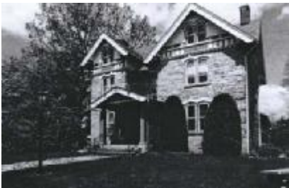
The Cherished Pearl