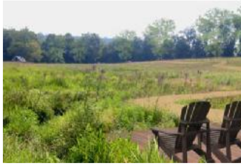
A photo simulation depicting a seating area.