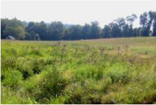
The existing meadow.

In order to help create a distinct identity for Squire Cheyney Park, unique seating is proposed for park users. Adirondack chairs secured to 12'x12' decks will be located in areas of the park selected for their scenic beauty and views. Chairs will be oriented towards picturesque views that best capture the site's natural amenities and former rural agricultural identity.